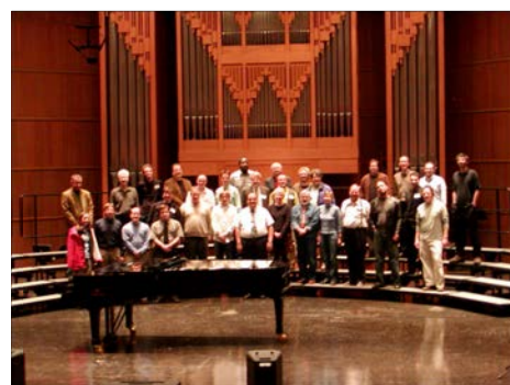
Group photo of the composers