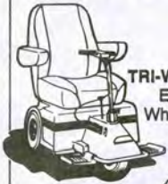
TRI-WHEELER Electric Wheelchair

ADAPTIVE EQUIPMENT & MODIFICATIONS FOR THE PHYSICALLY CHALLENGED VA & TEXAS APPROVED