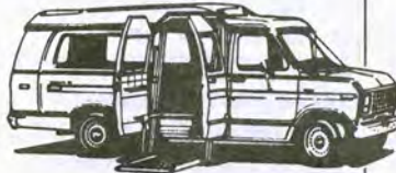
WHEELCHAIR LIFTS Fully & Semiautomatic