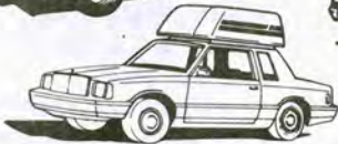
CHAIR TOPPER Car Top Wheelchair Carrier