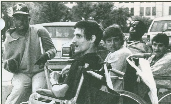
504 Day Participants march to City Hall in support of the Americans with Disabilities Act