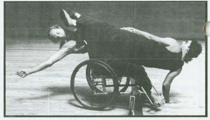
The Exposed to Gravity Project works with CTD Members at the Annual Convention.