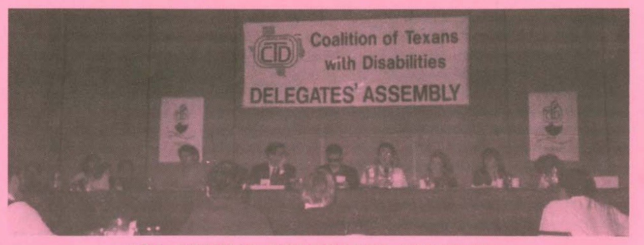
18th ANNUAL DELEGATES ASSEMBLY

The assembly this year was held at the Corpus Christi Bayfront Marriott, November 17 -November 19, 1995. When CTD arrived on Thursday, Nov. 16, we were not pleased with the inaccessibility of the hotel. When the CTD Board of Directors had checked it out in April, the hotel assured them that all accessibility problems would be corrected by the conference date. They weren't.