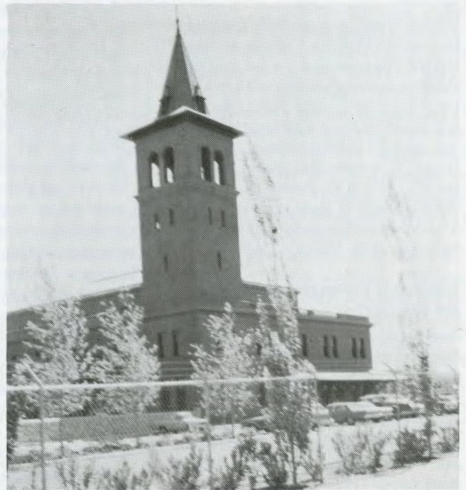
Take the train to El Paso for the CTD 1983 Delegate Assembly. El Paso's train station is newly remodeled and located near downtown.