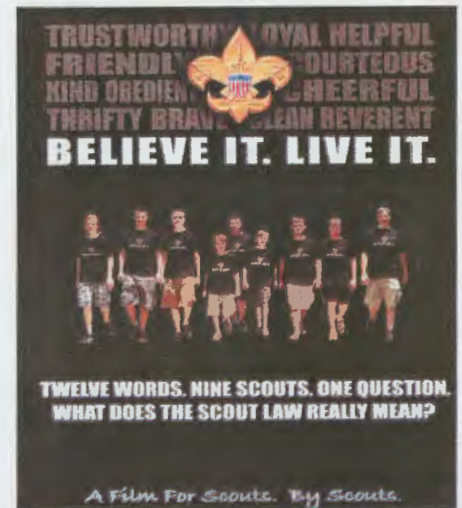
2007 2nd Runner-up/Secondary Level BELIEVE IT. LIVE IT. Created by Austin Boy Scouts