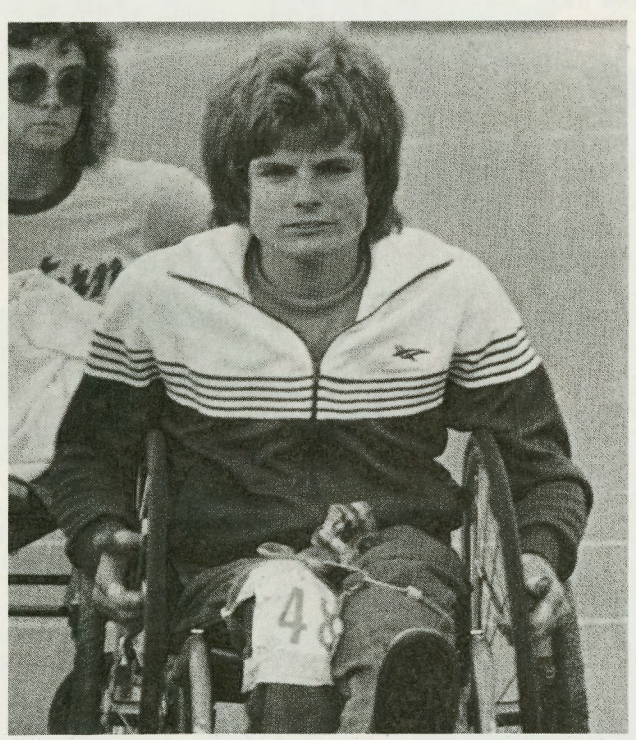
A member of the Texas team readies for the race.