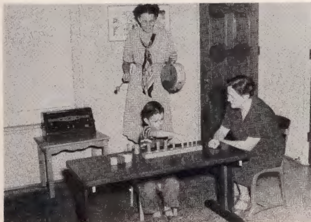
... Testing a child to determine if he has any residual hearing.

A Testing-Consultation Clinic is conducted in connection with Pilot Institute. Children from almost every state have been tested at this clinic. There is no charge for these services.