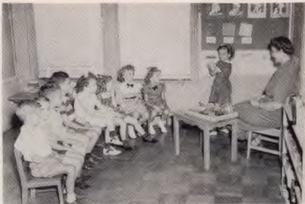
A lesson in lip-reading. "... all classes are small."