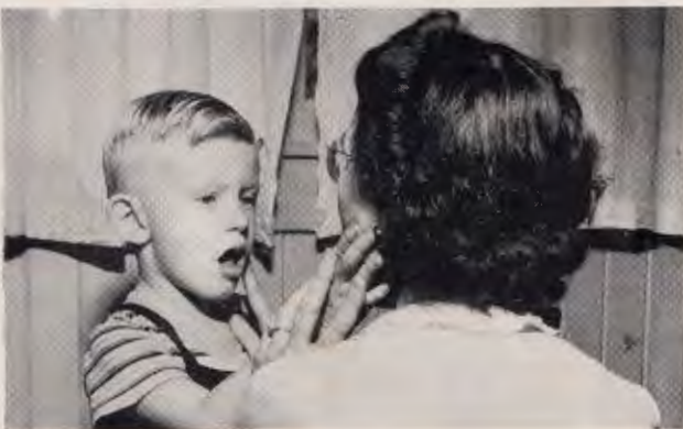
A lesson in speech.