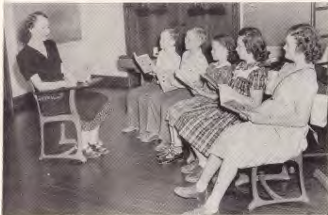
The older children in class.