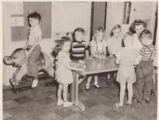
Some of the younger pupils.

Many, many other civic organizations and individuals have given of their time, services and financial aid, without which the deaf children at Pilot Institute could not have made the progress they have. The long waiting list testifies to the great need for oral training in the Southwest.