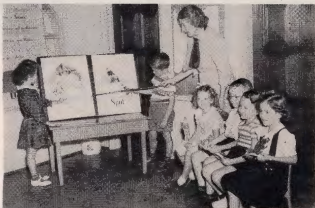
They learn the three R's, too . . .