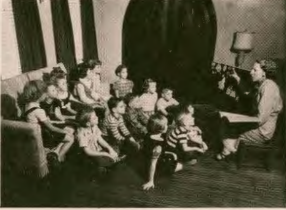
THE STORY HOUR From lip reading the children are enjoying the story of the Three Bears.

It is financed entirely by voluntary contributions, ex-