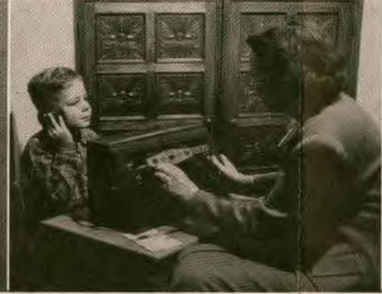
AN AUDIOMETRIC TEST With the aid of the audiometer an accurate test of the child's hearing loss is recorded.