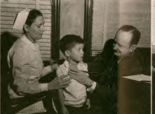
PHYSICAL INSPECTION A well child is a happy child.