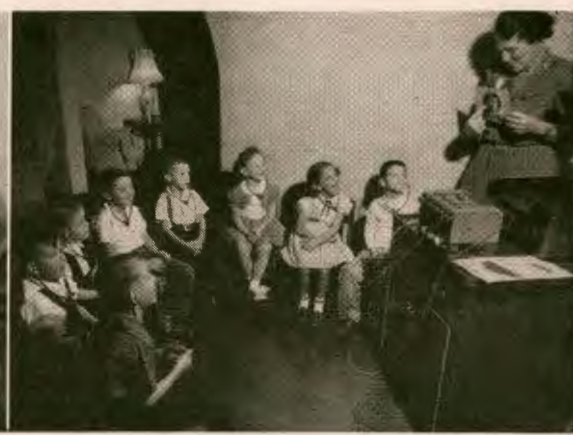
AN ACOUSTIC PERIOD A group of pre-school children enjoying nursery records with amplification.