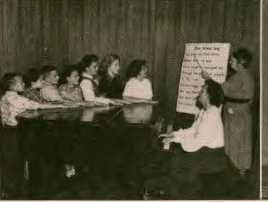
AN OLDER CLASS IN RHYTHM Through vibration the deaf child is able to improve his accent, fluency and phrasing.