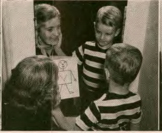
AN INDIVIDUAL SPEECH LESSON The child is aided by feeling vibration in the teacher's face as well as seeing the lip position