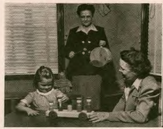
A CLINICAL TEST Testing a three year old to determine the amount of residual hearing.

Work of PILOT INSTITUTE is part of pattern shaping in the educational and medical progress of Dallas... it merits support