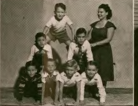
BOYS' TUMBLING GROUP Acrobatic dancing for muscular coordination and