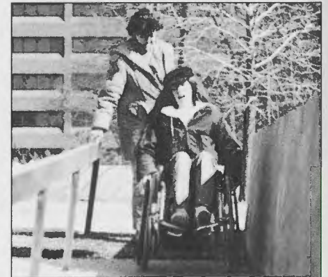
Students traverse one of many ramps on the State University of New York at Stony Brook campus.