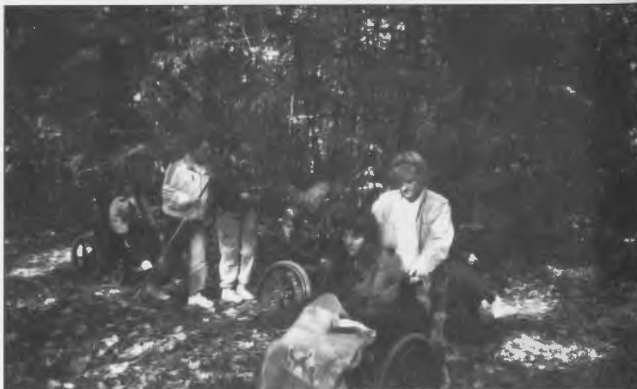
Students at Ball State University (Muncie, IN) take advantage of the programs offered through nearby Bradford Woods Outdoor Education Center.