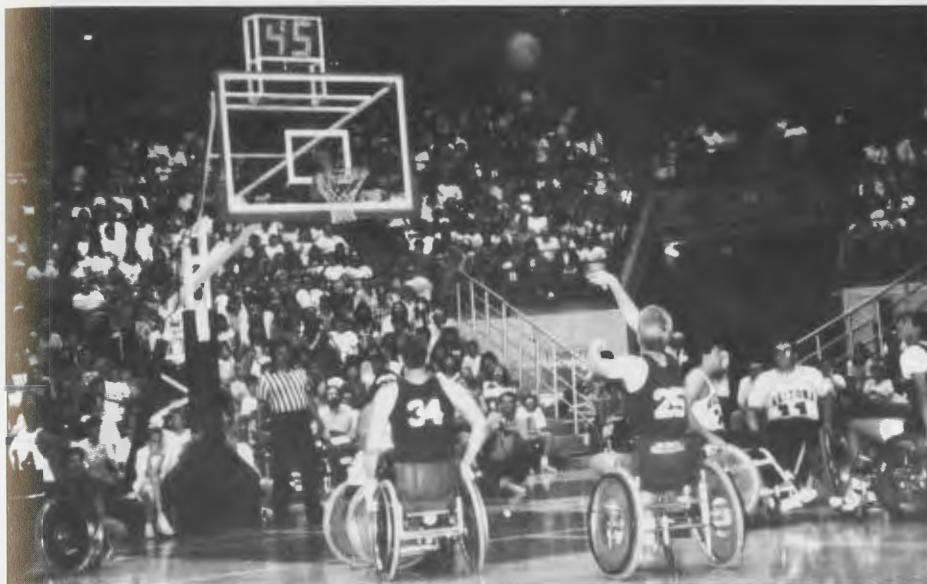
The University of Arizona, located in Tucson, offers wheelchair-sports programs in basketball, track, rugby, tennis, road racing, swimming, fitness, and weight-training.