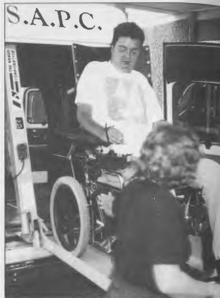
St. Andrews Presbyterian College, in Laurinburg, NC, has lift-equipped vans to transport their mobility-impaired students.