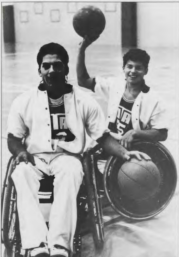
The University of Texas at Arlington annually awards at least one four-year scholarship to a freshman recruited for the wheelchair-basketball team.